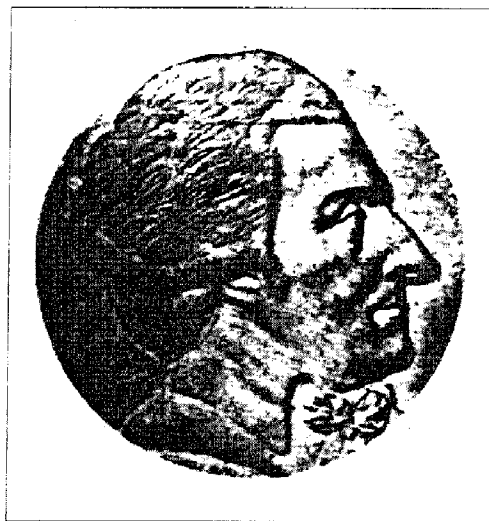
Guyton de Morveau

a lawyer and a well-known chemist from Dijon. In 1782 Guyton authored a bold project for reforming the entire chemical nomenclature(12). His reform was based on the assumption that denominations should reveal "the nature of things," like the botanical nomenclature set up by Carl Linneus, although Guyton chose Greek rather than Latin etymologies (presumably because of his