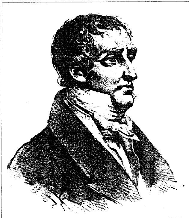
Antoine-Francois de Fourcroy

By contrast, the reform of nomenclature became a feature of normal science in the late nineteenth-century with the institution of regular international conferences. Following the first International Conference of Chemistry held in Paris in 1889, a special section was appointed under the leadership of Charles Friedel (1832-1899), who was in charge of preparing a set of recommendations to be voted during an international conference on chemical nomenclature held in Geneva in April, 1892. The rules were aimed at coordinating the individual attempts made at systematizing the nomenclature of organic compounds. For instance, Williamson introduced parentheses into formulas to enclose the in-